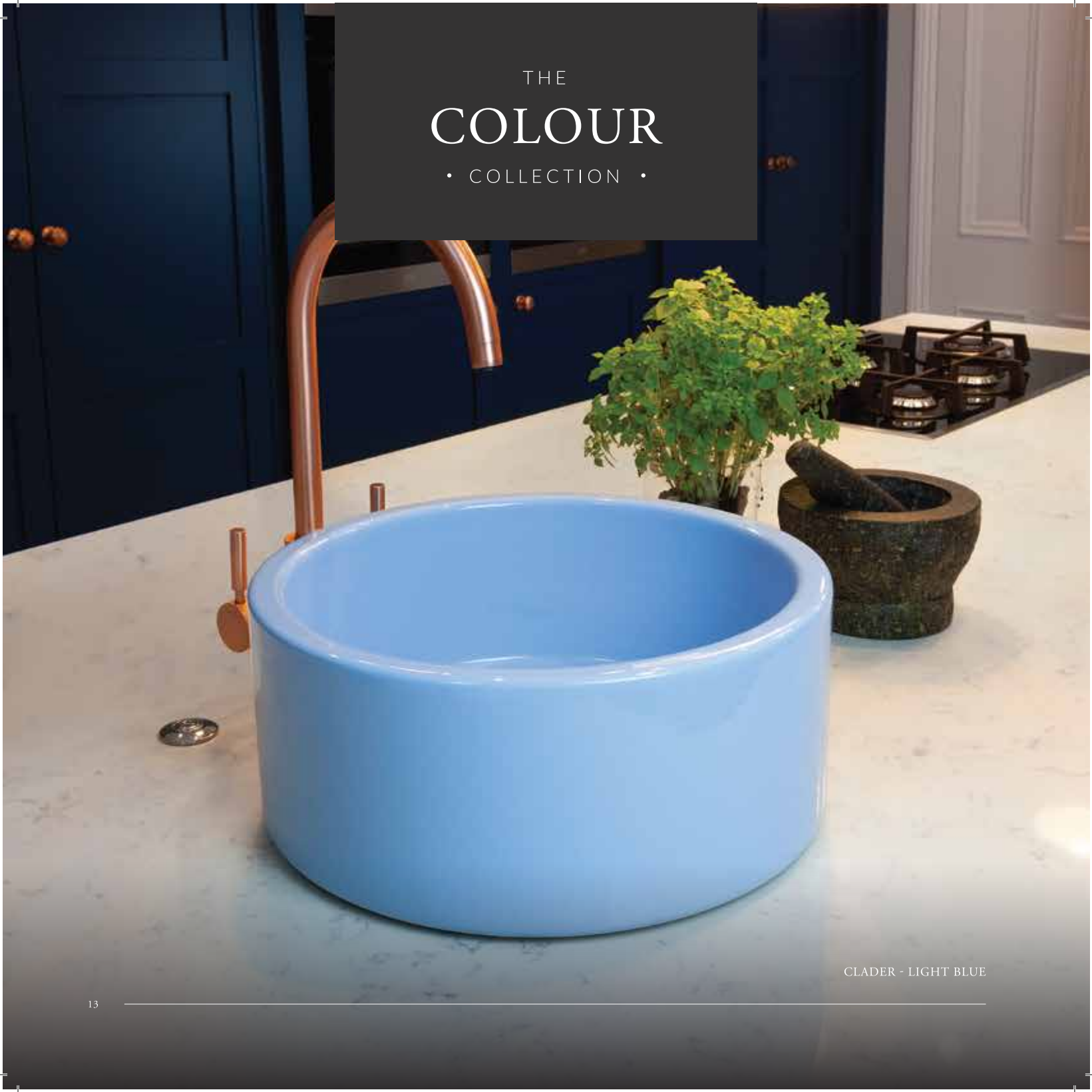
CLADER - LIGHT BLUE