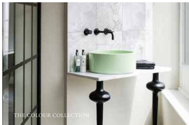
THE COLOUR COLLECTION

Every authentic sink in our collections takes time to create, and the result is a true masterpiece of traditional manufacturing. They are made here in North West England by our very own talented craftsmen, who use long-established techniques (passed down through generations of local artisans) to produce iconic heritage and contemporary designs.