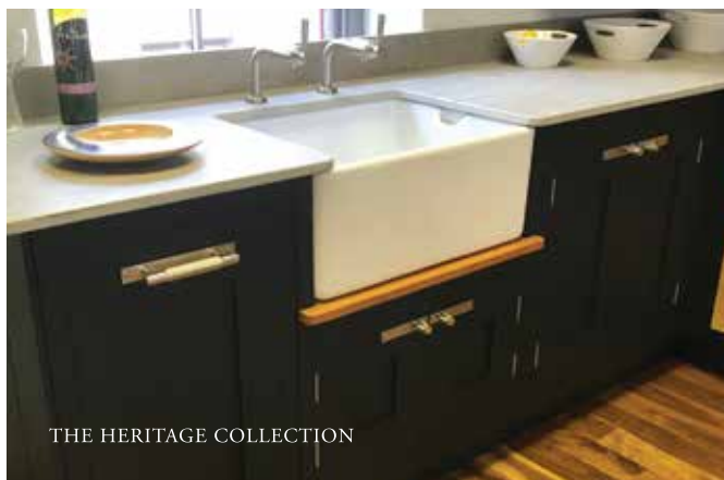
THE HERITAGE COLLECTION