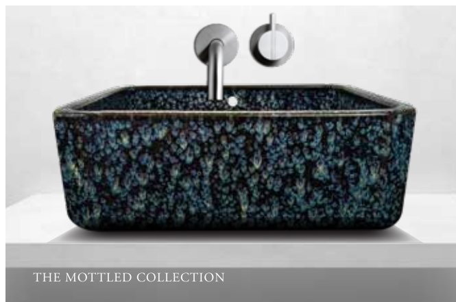
THE MOTTLED COLLECTION